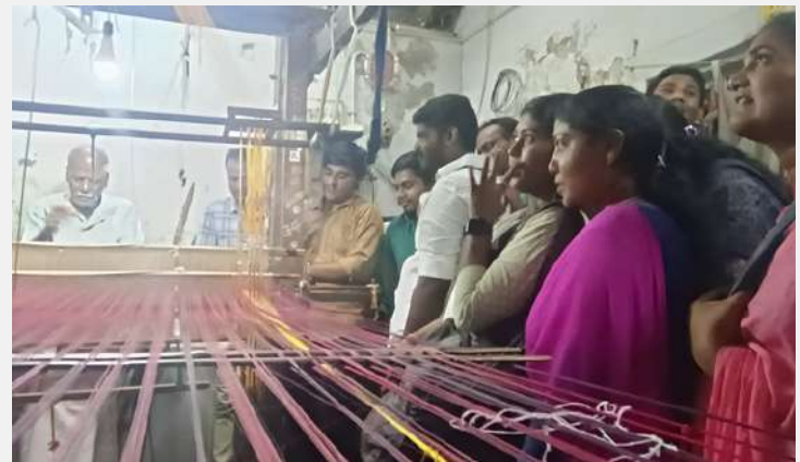
Weaver's Cooperative, Madurai