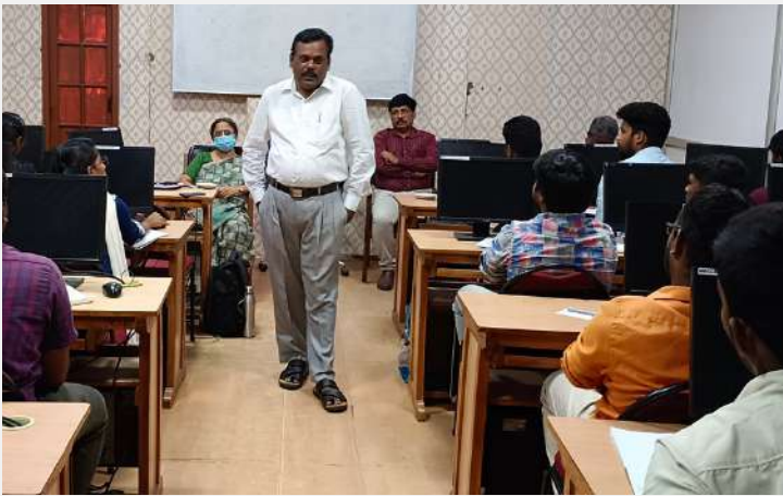
MDCC Bank, Madurai