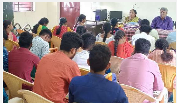
Urban Cooperative Bank, Thirumanagalam