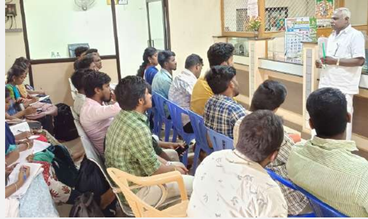
Poondi, Madurai PACCS