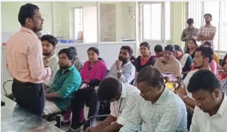
E- NAM, Madurai

As a part of the HDCM Programme, the participants of 54th batch of our institute has undertaken field visits to various cooperatives in Tamilnadu from 8th - 19th May, 2023. The participants have gained practical knowledge and experienced field observations about the functioning of cooperatives.