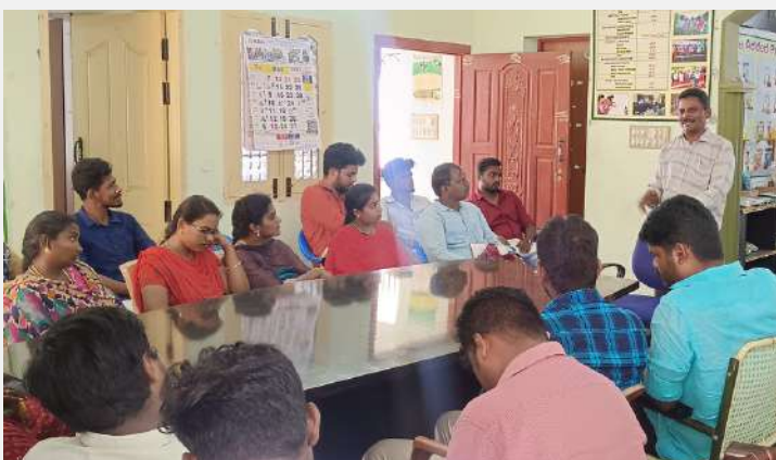
Viruthai Millets, Virudhunagar